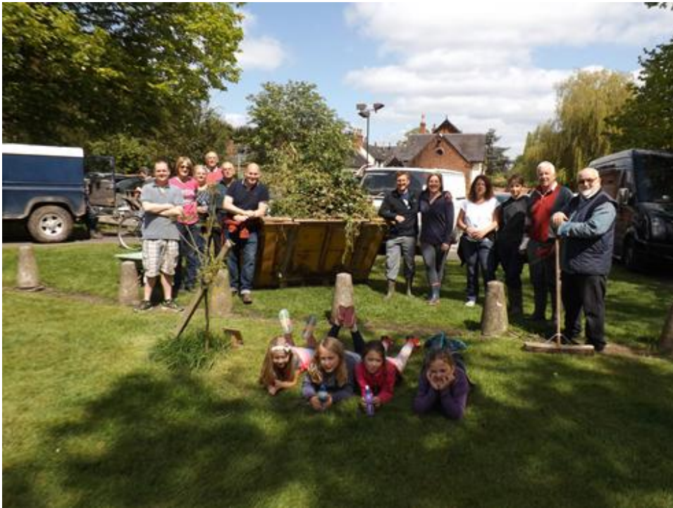
Picture of some of the volunteers who helped achieve so much on Clean-up day May 2016

follow us @AboutRolleston for local alerts